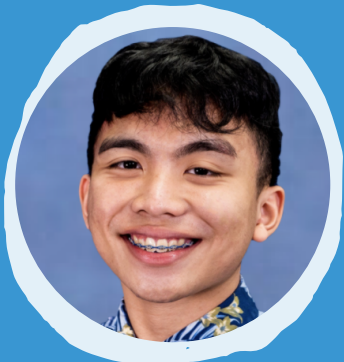
ENJL HIMOYA: HISTORIAN

"Student voice means standing up for what is right for both you and your peers. It's about being an advocate for the betterment of your community."